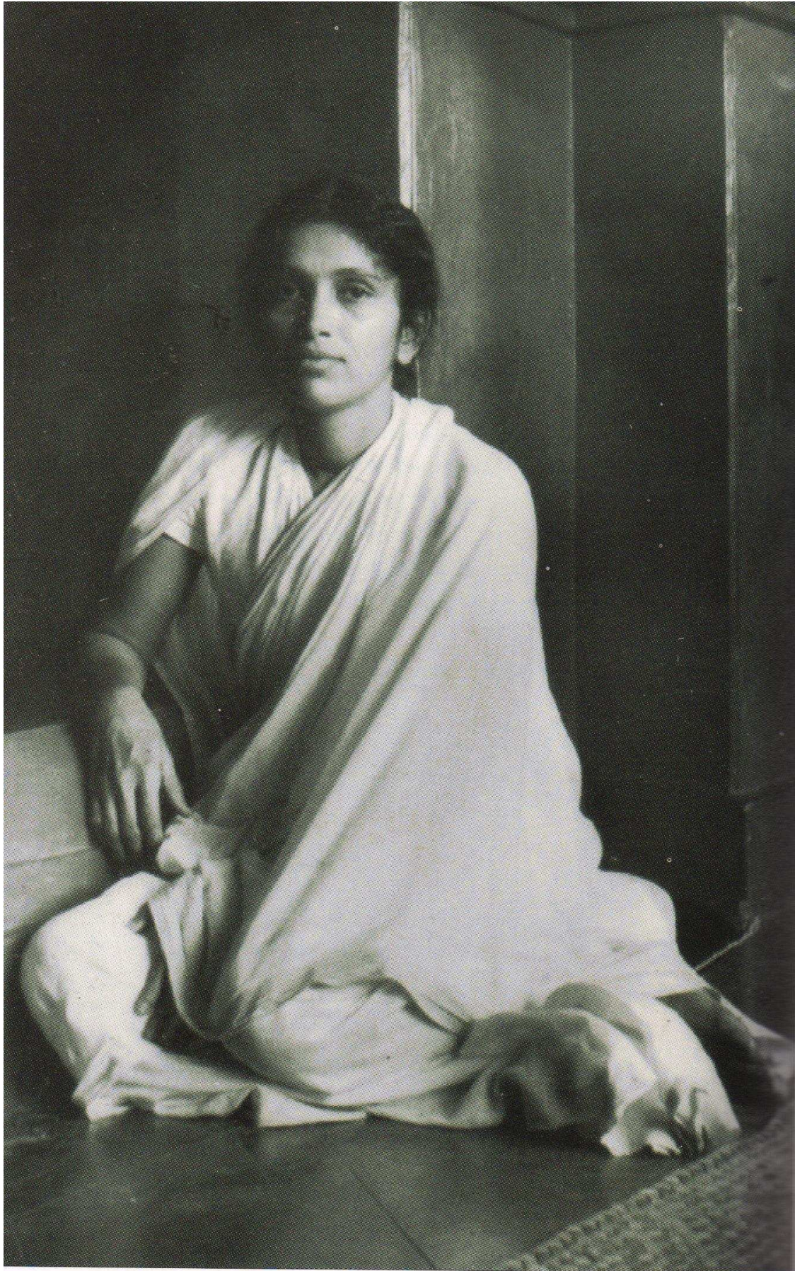
PUJYA MATAJI KRISHNABAI